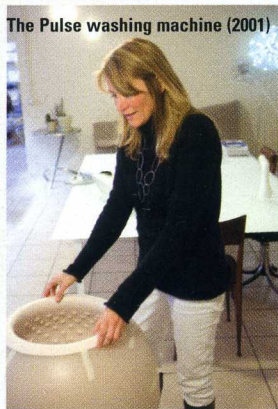
The Pulse washing machine (2001)

"Our solar power project is extremely interesting. Sustainability is a major issue for human beings. If we really aim to survive the next future, then design is a small yet interesting medium to produce new concepts and products to encourage people to change their lifestyle."