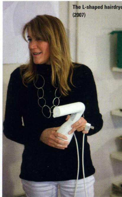
The L-shaped hairdryer (2007)